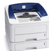
Phaser 3250 shown with optional Tray 2