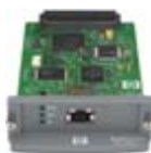
HP Jetdirect internal print server

Print professional documents and save time with the automatic two-sided printing unit (standard on the 5200dtn model).