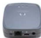
HP Jetdirect wireless external print server

Increase efficiency and security by installing the HP Jetdirect 635n IPv6/IPsec and Gigabit Ethernet internal print server in the available EIO slot.