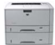
HP LaserJet 5200dtn printer