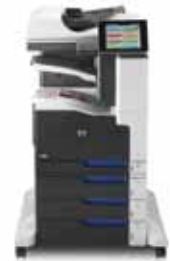
(HP LaserJet Enterprise 700 Printer M775z)