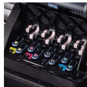
HP Double Swath Technology