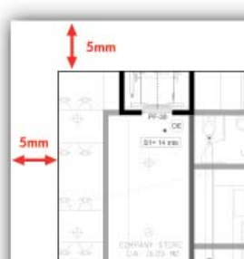
5 mm margins