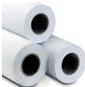
HP long media roll