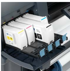
HP large black ink cartridge

* Compared to any HP Designjet 600/700/800/ 1000 Printer